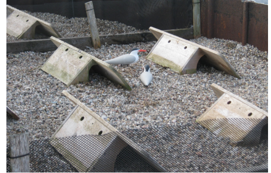
Tern shelters on Navcell 180

As of this date the construction plans for our tern shelter have been downloaded from the Lab of Ornithology website more than 200 times! It's nice to think that our tern program is having a beneficial impact beyond our own geography.